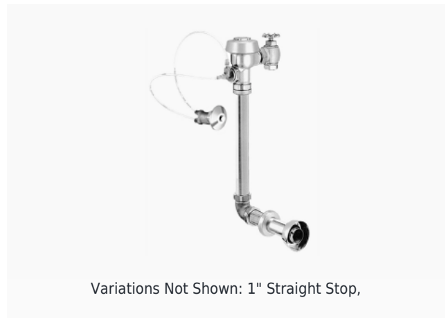
Variations Not Shown: 1" Straight Stop,