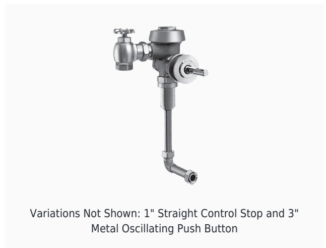
Variations Not Shown: 1" Straight Control Stop and 3" Metal Oscillating Push Button