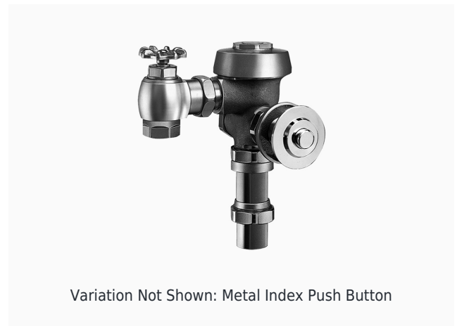
Variation Not Shown: Metal Index Push Button