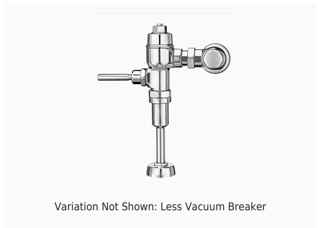
Variation Not Shown: Less Vacuum Breaker