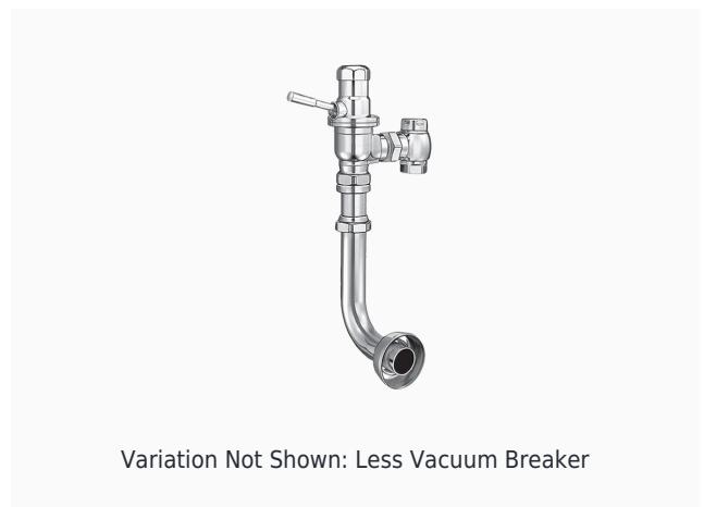
Variation Not Shown: Less Vacuum Breaker