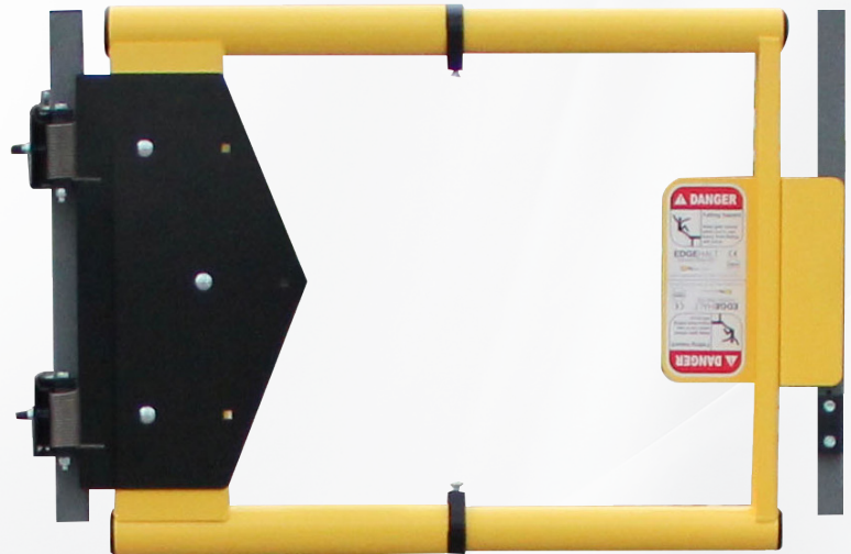
Product Number: ASG-1836-PCY