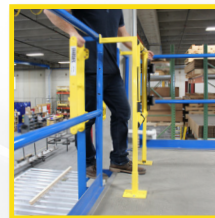
Stand-Off Mounting System