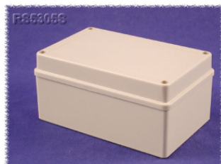
Assembled View (Top)