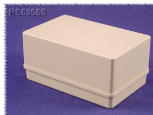
Assembled View (Bottom)