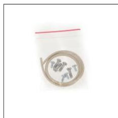
Hardware includes lid screws, PC board screws, and gasket