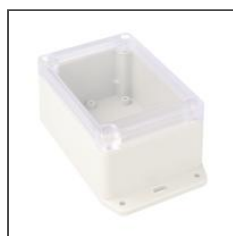
Clear Lid (polycarbonate version shown)