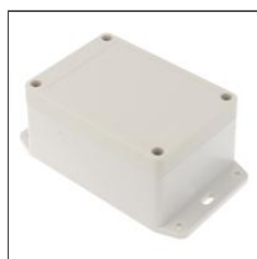
Opaque Lid (ABS version shown)