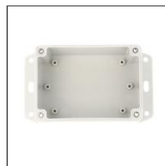
Internal mounting points for PC boards or panels