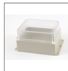
Some models supplied with deep lids.