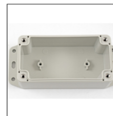
Internal DIN rail mounting point.