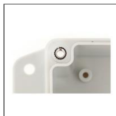
Features corrosion resistant inserts for lid assembly