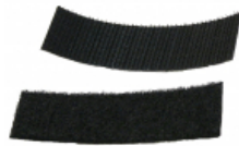
Hook & Loop Mounting Strip 1592ETV