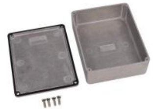
Watertight versions and gasket upgrades available for most sizes