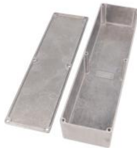
Lap joint construction where lid and box meet