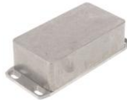
Spot-welded bottom flange