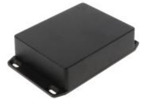
Wallmounting flange integrated into lid