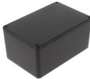
No mounting flanges