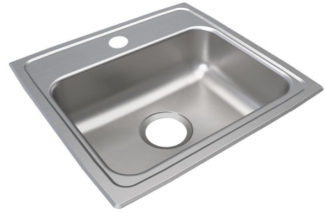
Shown with one-hole configuration. Other configurations available.

A Century of Tradition and Quality. For more than 100 years, Elkay has been making innovative products and providing exceptional customer care. We take pride in offering plumbing products that make life easier, inspire change and leave the world a better place.