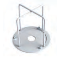
125GRD Protective Wire Guard