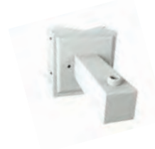
CBR Corner Mount Bracket