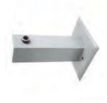
WBR Wall Mount Bracket