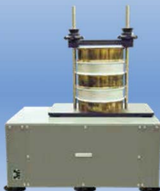
Model E6100 with 8" Sieve Stack

The E6100 and E6200 Sieve Shakers are a 2 speed shaker designed for quick sample separation. They utilize a reciprocal action on the sieve platform enhanced by a vertical acceleration component imparted to the sample through rocker arm linkages thus increasing the efficiency of the separation. A stack of up to eight 2" high sieves (not included), may be used, all being held in place by a simple locking system. This model can be manufactured to hold 6", 8" and 10" sieves. See our website for more sizes. An optional upgrade allows the sieve platforms to accept 2 different sieve sizes.