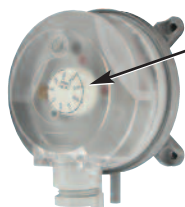
Dual Scale Field Adjustable Set Point Knob