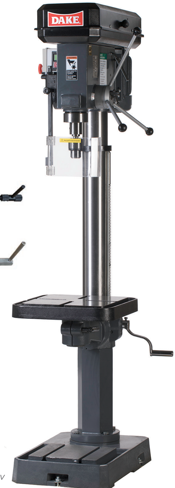
Part Number 977400-1V