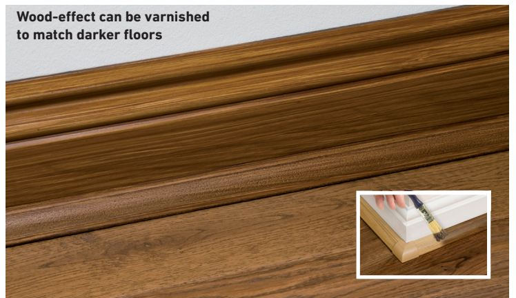
Wood-effect can be varnished to match darker floors

Quarter round 0.87" x 0.87" profile covers expansion gaps between floors and baseboards, while providing an easy-to-use cable raceway around floor perimeters, or worktops.