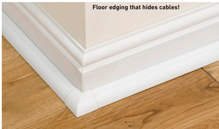
Floor edging that hides cables!