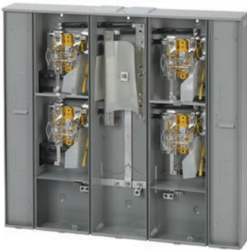
VENMP20434CGRST5K9 shown open & closed

200 Amp Condo Pak with Main Breaker Provisions - 600 VAC