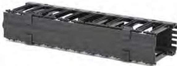
SB87019S2FB Standard Length (2U)