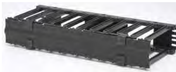
SB87019SX2FB Extended Length (2U)