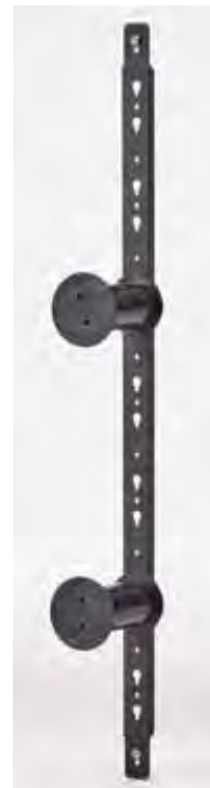
84" Tall Kit SB860ACSK084FB