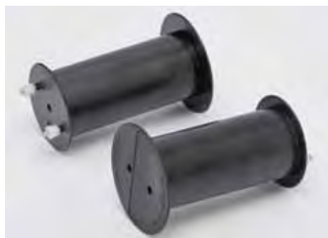
5" to 8" Adjustable Depth SB860ACSF B