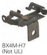
BX4M-H7 (Not UL)