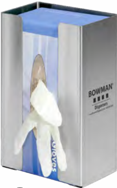
GS-073 (STS) Single - Large Capacity Also available - Clear PETG Plastic GP-020 (PET) White Powder-Coated Steel GB-074 (CRS)