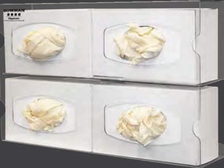
GL143-0111 (PET) Also available GL143-0212 (ABS)