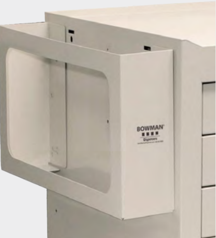
GL136-0412 (CRS) Cart Attachment - Triple

Upgrade your current med, dialysis, crash-cart, or any cart by mounting or hanging a Glove Box Dispenser to the unit.