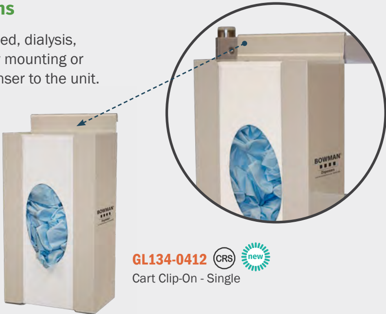
GL134-0412 (CRS) Cart Clip-On - Single

All consumable items are for demonstration purposes only and are not available for purchase through BOWMAN®