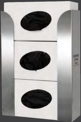
GL018-0300 (STS) Also available GP-330 (PET)