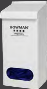
GC-009 (STP) Bulk

All consumable items are for demonstration purposes only and are not available for purchase through BOWMAN®