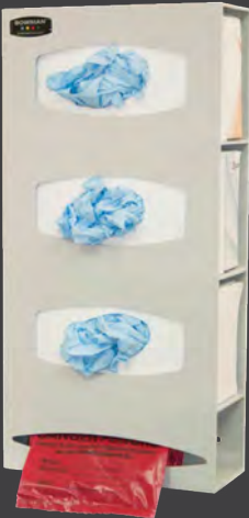
PS004-0212 (ABS) Triple Glove & Single Bag Also available PS004-0111 (PET)