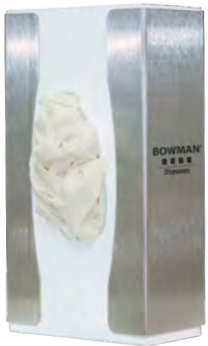
GL102-0300 (STS) Single - Extra Narrow Also available - Clear PETG Plastic GL102-0111 (PET)