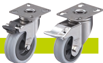
illustration with plastic brake pedal, colour black illustration with plastic brake pedal, colour grey