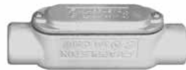
Grayloy™-Iron Conduit Body with cast cover. 1" Type C shown